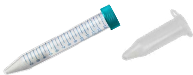
dSPE columns, CHROMABOND® QuEChERS Mix XII, 15 mL centrifuge tubes, CHROMABOND® QuEChERS Mix XX, 2 mL centrifuge tubes

QuEChERS ("Quick, Easy, Cheap, Effective, Rugged and Safe") sample preparation products from MACHEREY-NAGEL ensure a time efficient and simple extraction of PFAS from food and a subsequent solid phase extraction for further sample clean-up according to procedure C-010.01 developed by the US Food and Drug Administration (FDA) for the measurement of 16 PFAS in food.