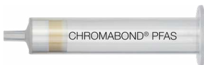
SPE column, CHROMABOND® PFAS

These allow outstanding recovery rates and high reproducibility.