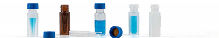
Polypropylene vials and fluorine-free closures for PFAS analysis

MACHEREY-NAGEL offers polypropylene screw neck vials N 9 and snap ring vials N 11 as well as appropriate closures with a silicone/polyimide septum that – in contrast to PTFE laminated liners – is fluorine-free.